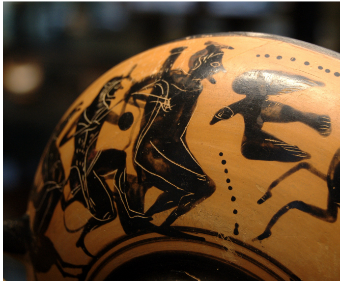
Figure 01: Prometheus, who had been punished by Zeus, is freed by Heracles. Scene depicted on black-figured cup made in Athens, ca. 500 BCE. Part of the collection of the Louvre.

Subsequently, living on Earth becomes a drama. Zeus does not only punish Prometheus but the human population as well. Technological progress, the myth tells us, does not come without cost. While there might have been earlier versions of the Prometheus myth, the earliest version that has survived is in the writings of Hesiod. Hesiod lived most likely between the end of the 8th and the middle of the 7th century BCE (Hesiod and Most, 2006).