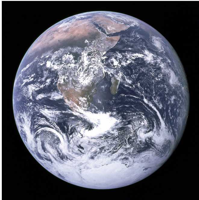
Figure 04: Blue Marble, photo of the Earth taken on December 7, 1972, by the crew of the Apollo 17 spacecraft en route to the Moon at a distance of about 29,000 kilometres (18,000 mi).

In 1969, one year after 2001: A Space Odyssey was released, the media-connected world witnessed the first landing on the moon. Images of an alien – not particularly homely – world reached the Earth’s population. The universe opened up with these images from the moon. A new sense of power emerged. Yet, a photograph that was taken three years later, in 1972, on the Apollo 17 flight had possibly an even higher impact on how people perceive life on the Earth. On December 7, 1972, the astronauts of the Apollo 17 crew were able to take the first picture of the planet Earth that showed it as a perfect globe, i.e., without shadow. The image is entitled Blue Marble (Reinert, 2011).