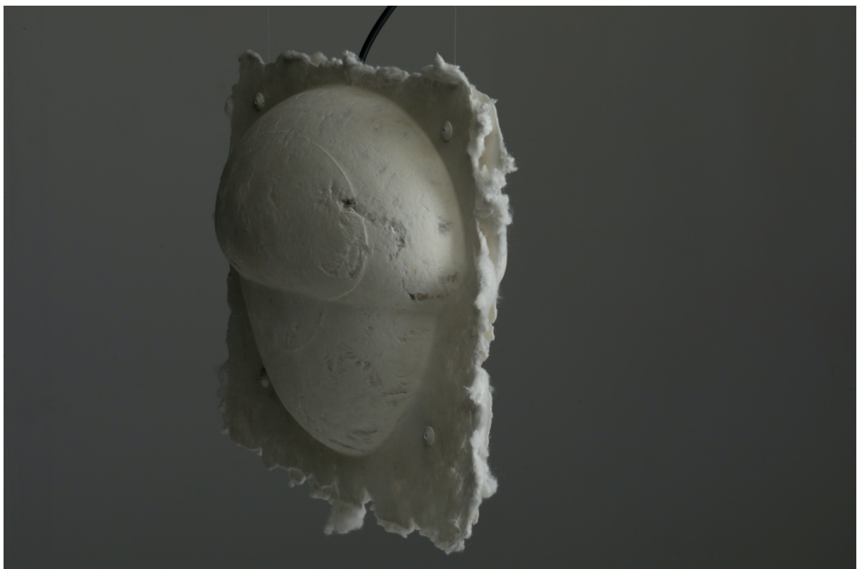
Always the Sun Tejo Remy Jacob de Baan 04.jpg