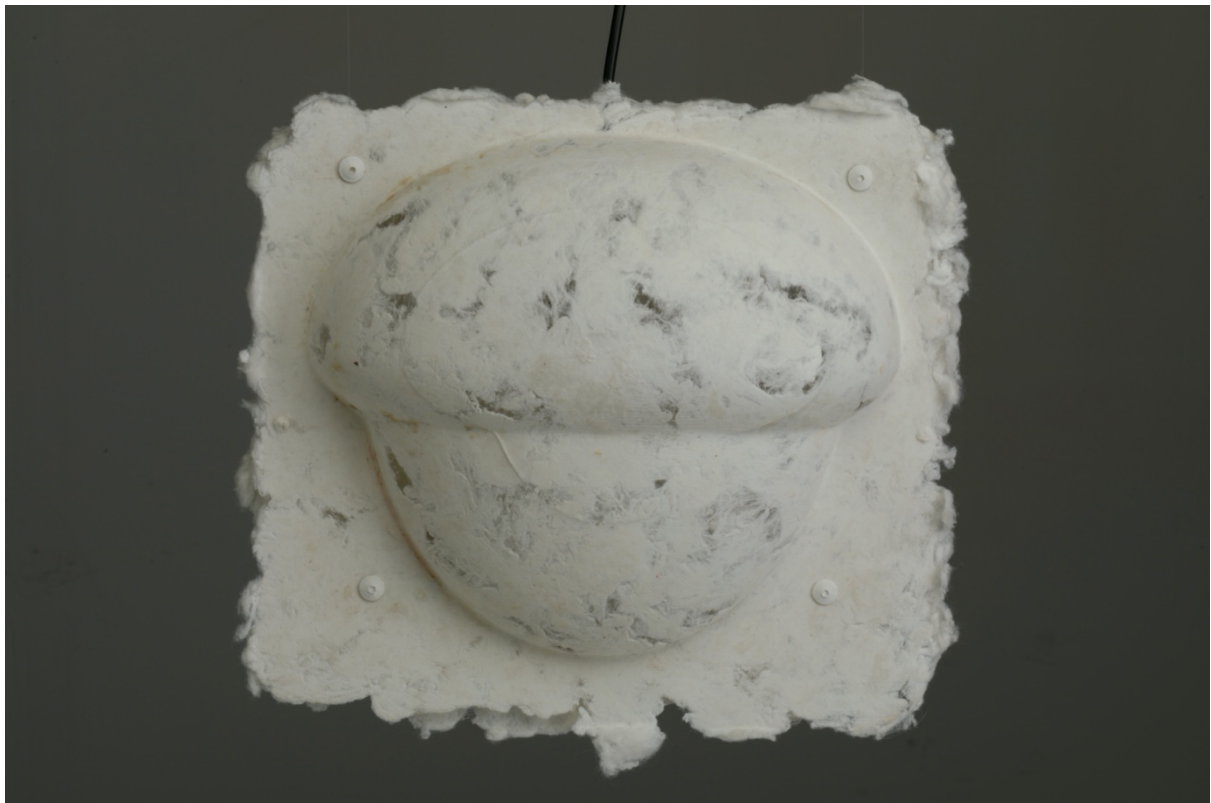
Always the Sun Tejo Remy Jacob de Baan 03.jpg