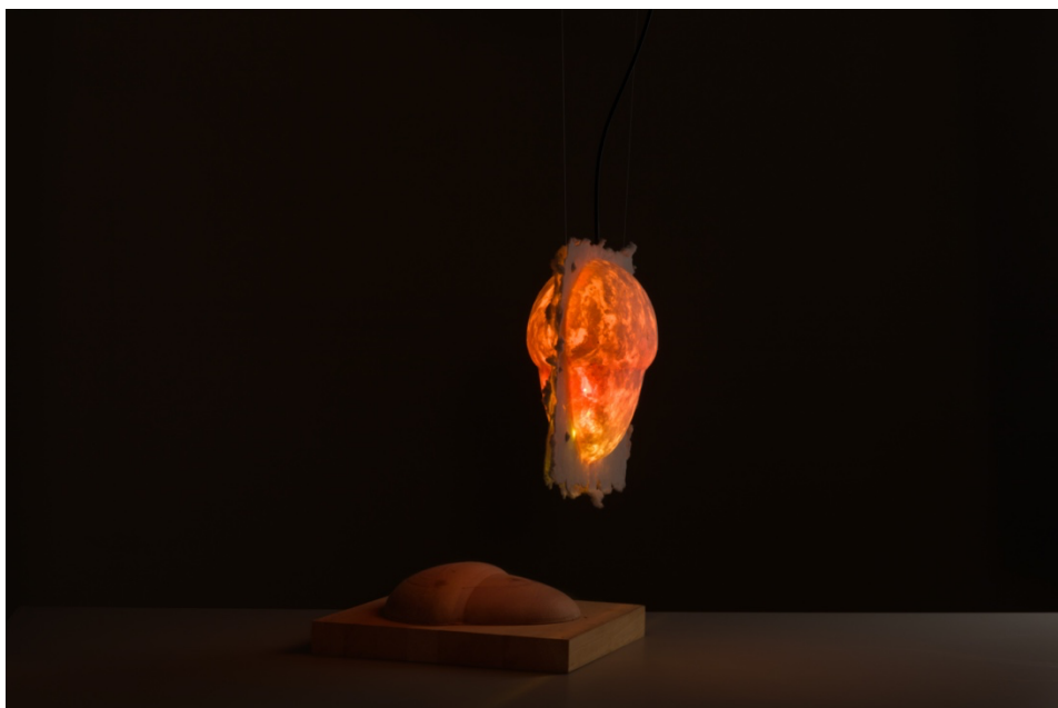
Always the Sun Tejo Remy Jacob de Baan 02.jpg