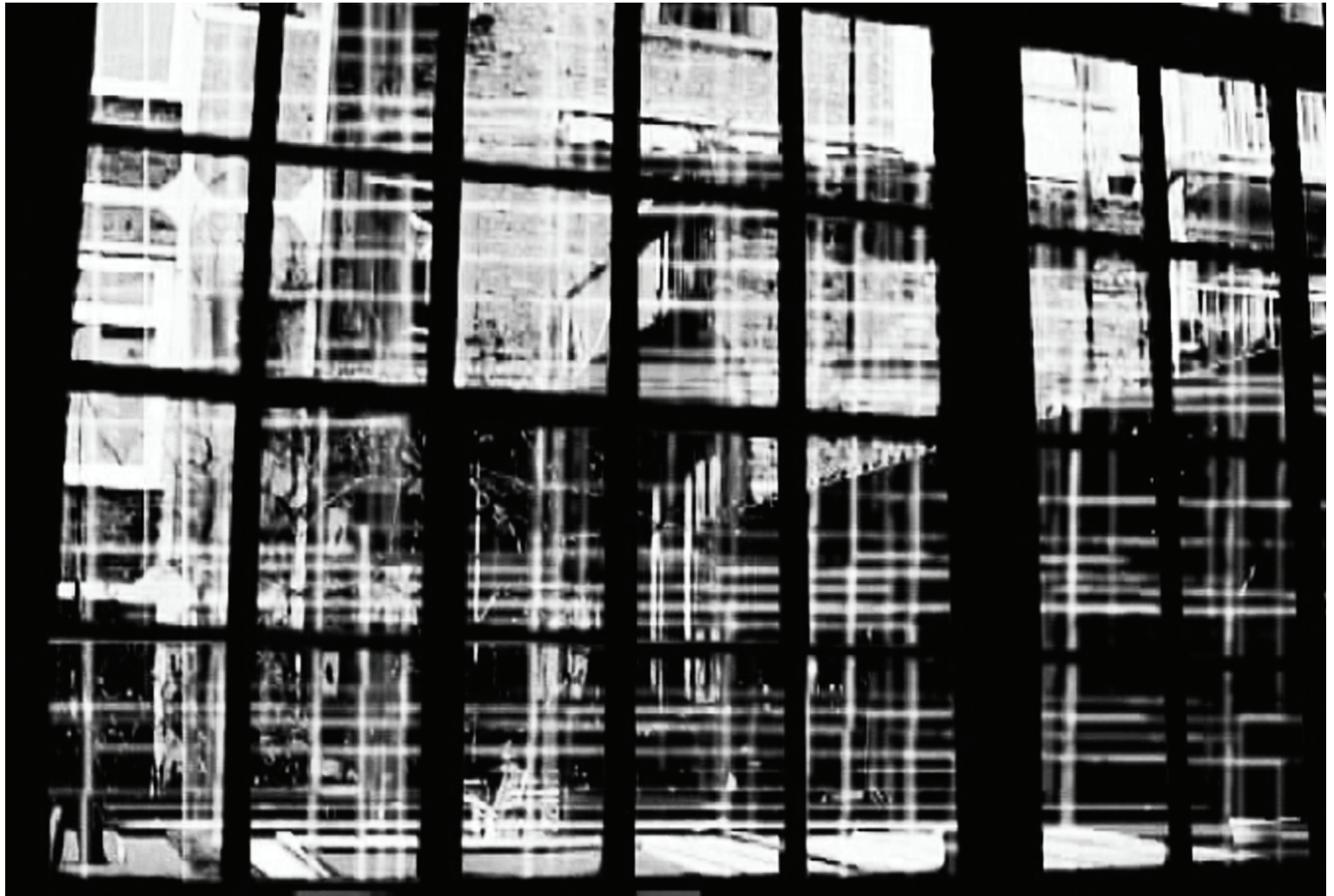
Figure 8: Screenshot of video composition: btd x , 2000.