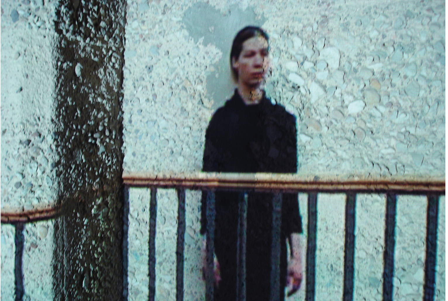
Figure 1: Photograph of video installation: Waiting, installation, Dallas, USA, 2005.