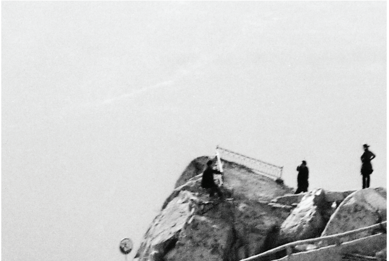
Figure 3: Photograph: Eastern Journey – Part I, China, 2004.