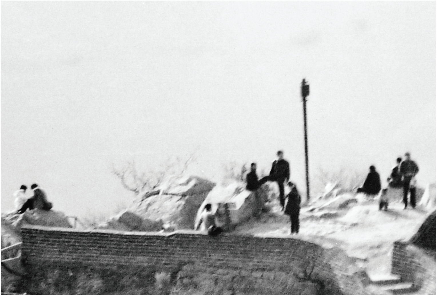
Figure 4: Photograph: Eastern Journey – Part II, China, 2004.