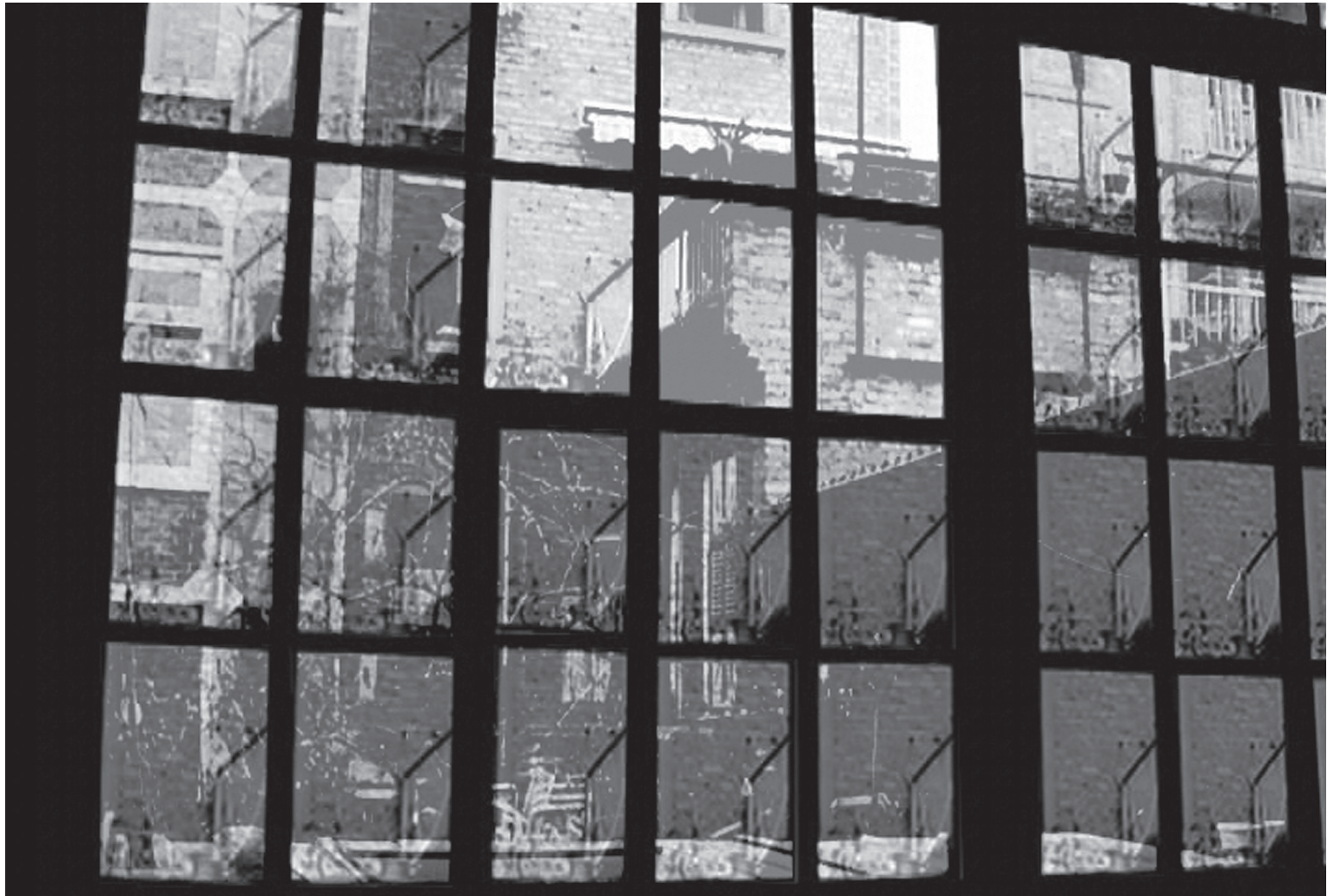
Figure 6: Screenshot of video composition: btd x , 2000.