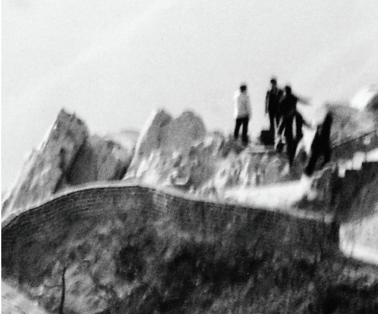
Figure 5: Photograph: Eastern Journey – Part III, China, 2004.